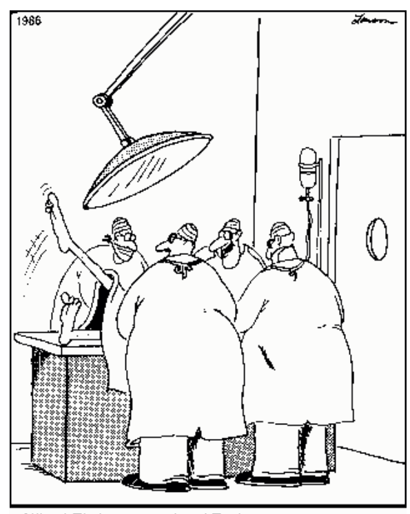
"Whoa! That was a good one! Try it, Hobbs — just poke his brain right where my finger is."